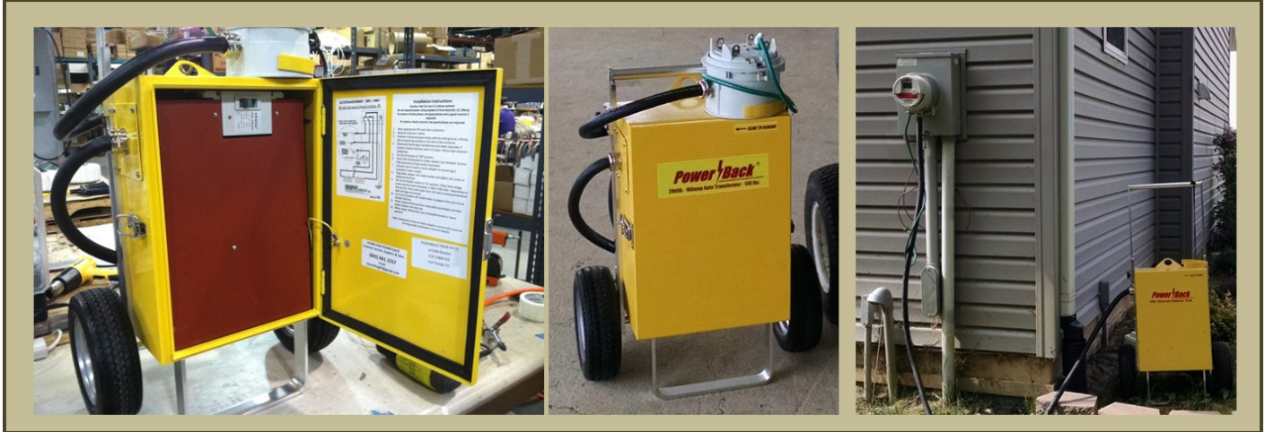
PB15KM (15KVA) SUPPORTS 150A SERVICES