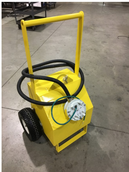
PB30KM (30KVA) SUPPORTS 320A SERVICES