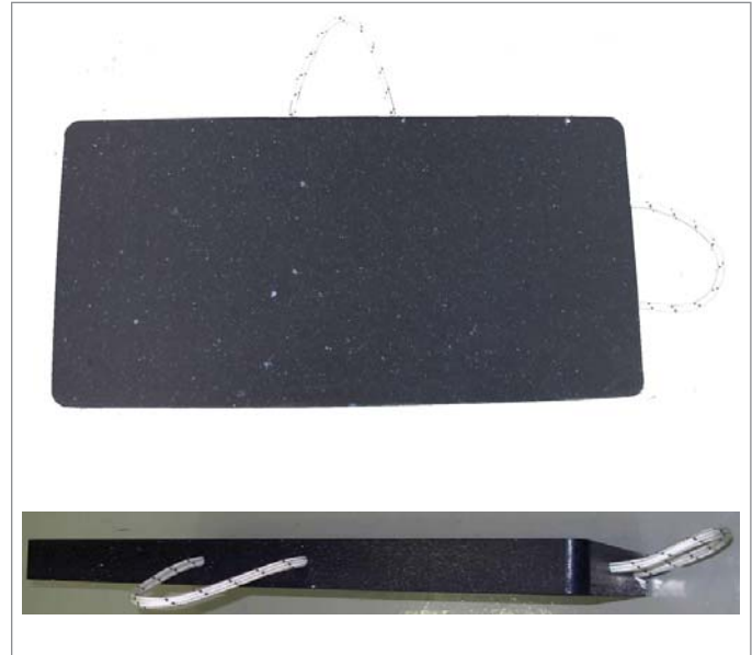
Outrigger Pad (front and side views)

LTL outrigger pads are ideal for use with radio boom derricks (RBD), digger derricks, single or double bucket trucks and cranes.